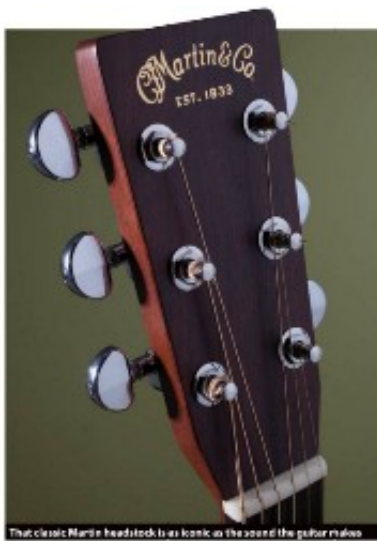
That classic Martin headstock is as iconic as the sound the guitar makes